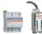
Surge Protection Devices (UL & IEC)