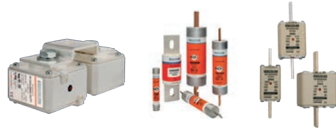
Fuses & Fuse-holders