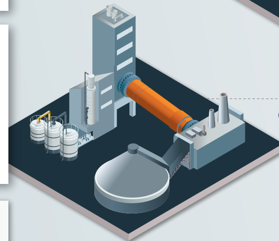
CEMENT PROCESS & STORAGE