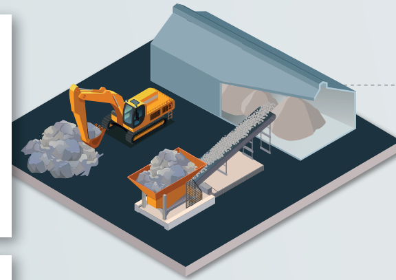
RAW MATERIAL TREATMENT