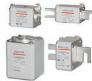
High Speed Fuses